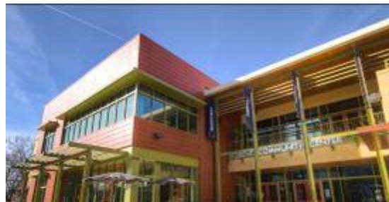
UC Davis Student Community Center Davis, CA