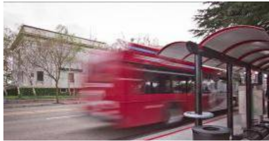
San Joaquin Regional Transit District Bus Rapid Transit (BRT), Stockton, CA

advanced capabilities of GPS and TPS, combined with the human insight needed to apply them, we deliver reliable and accurate surveys you can build on.