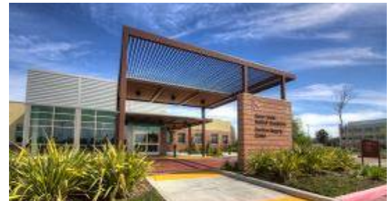
Sutter Gould Stockton Ambulatory Surgery Center, Stockton, CA